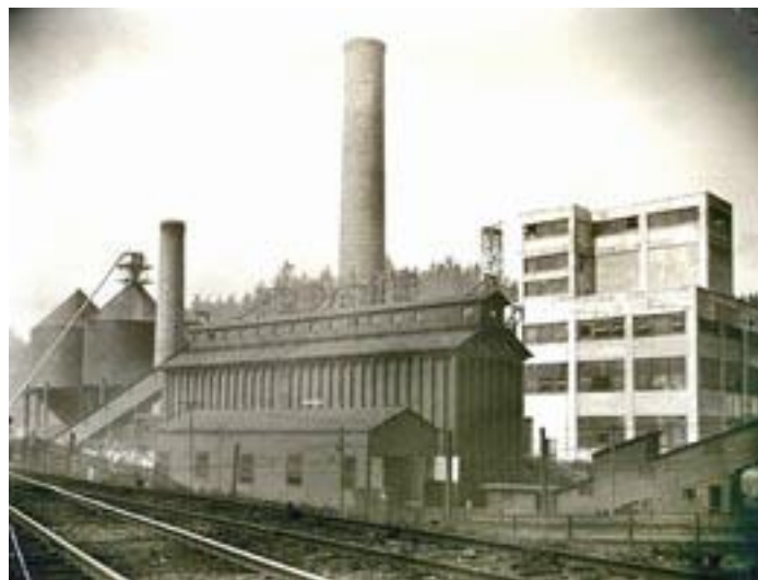
Camas Paper Mill Crown-Willamette c. 1920

The mill produced newsprint until 1930 when it stopped due to cheaper Canadian production. By removing newspaper manufacturing, Camas was able to become the largest specialty mill in the world.