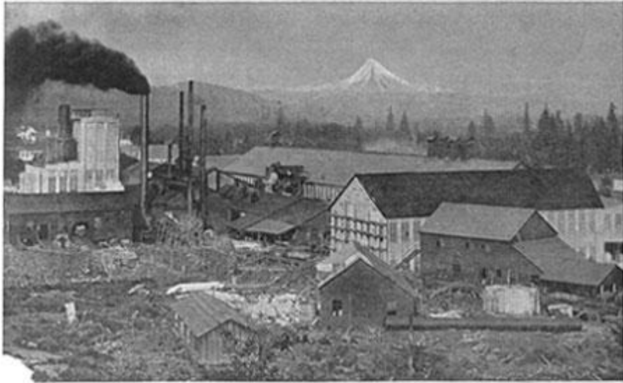
Camas Paper mill circa 1890

The mill started making paper from wood pulp in 1892 and was the first western mill to do this.